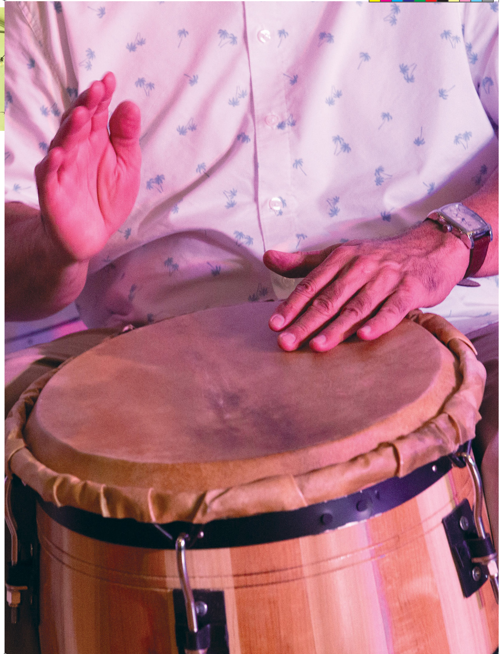
Opposite, Movimiento Cultural Afro Continental performed and taught Bomba music and dance from Puerto Rico.